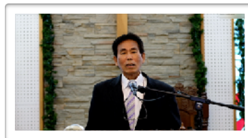
A guest speaker, from the local Bible school

We had been planning to come back to Canada later this year for a proper furlough to meet with all of you, but because of the travel and quarantining issues associated with coronavirus, we've decided to stay put in Japan until we're vaccinated. Over the past year, the Japanese government has changed the rules governing foreigners' travel in and out of the country several times without warning, so we don't want to get caught outside of