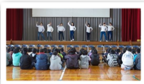
Just before lunch was the grade 4 class.