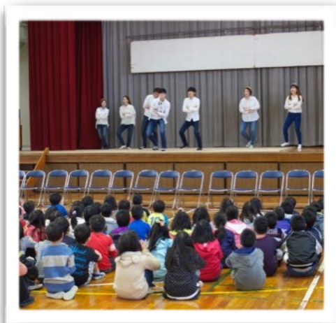
First, a presentation to grades 1 & 2. (This is a K-pop segment.)

A team of 10 university students from Campus Crusade for Christ (CCC) Korea came to Itoman Seaside Chapel in January. God opened the door for them to do a Korean culture presentation at a public school. Some of these kids later came out to a Kids' Party and heard the gospel. Here are some pictures from when we visited the school.