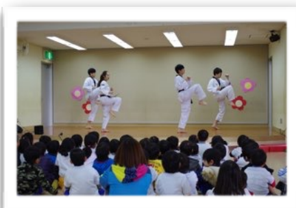
Then we went to the kindergarten classes. (This is a Tae Kwon Do segment.)