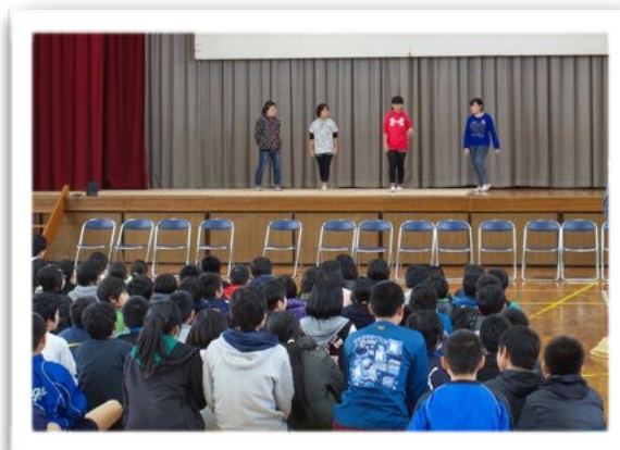
Some of the older girls had a presentation to show us too: a K-pop dance!