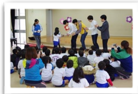
They even presented us with hand-made gifts!