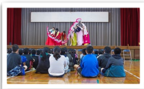
Last was a presentation to grades 5 & 6. (Traditional Korean dance, with costumes and fans.)