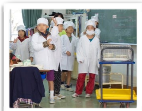
The kids serve each other lunch. Each one wears a smock and a chef's hat.