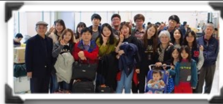
Saying goodbye to the CCC team.